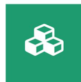
System and architecture quality assessment